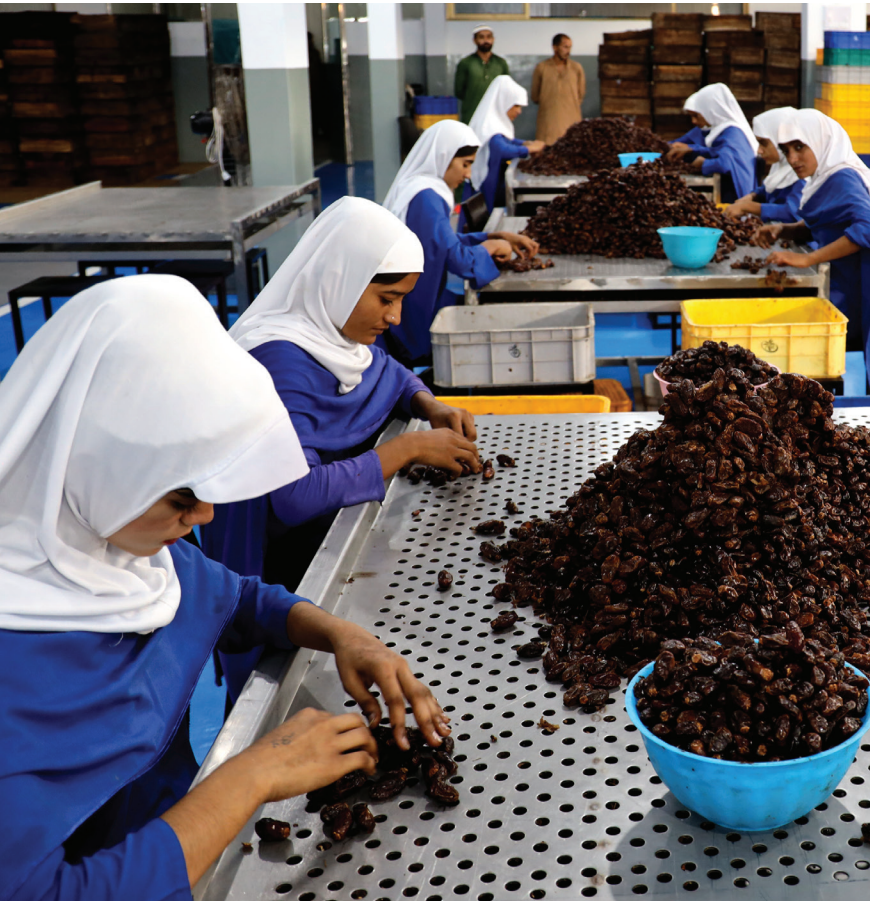
Factory workers sorting dates in district Khairpur Sindh, Pakistan.